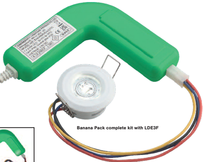
Banana Pack complete kit with LDE3F