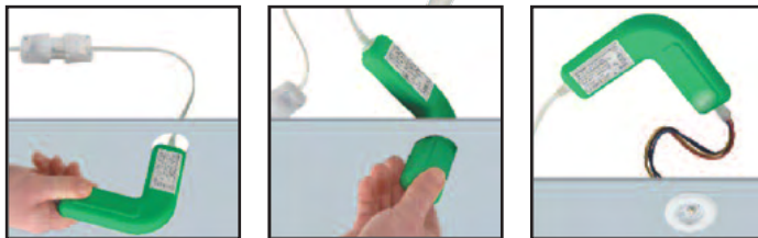
Banana Pack rolls neatly through 45mm diameter ceiling tile cut-out.

NOTE: Banana Pack with LDE3F downlights can be equipped with SurePath BLE Bluetooth addressable Gateway modules. See Data Sheet .