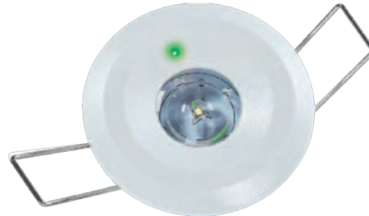
LDE3F/WID/D/WH White Downlight

The Banana Pack has Class II insulation, an extra low voltage output and features double insulated wires to the downlight to provide additional mechanical protection.