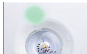
Operation indicator LED shines through a skin in housing plastic