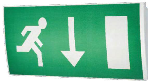
EC sign format