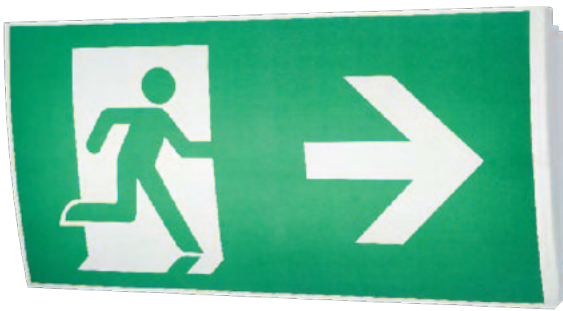
ISO sign format