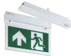
MXL/ESA09/LFP (with white recessing bracket)

NB: All versions supplied with a complete set EC and ISO legend screens