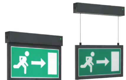
MXL/ESA10/D2/LFP/BLK (large) Black MXL/ESA11/D2/LFP/BLK (large) Black

** = Add suffix AR-right or AL-left or AD-down or AU-up