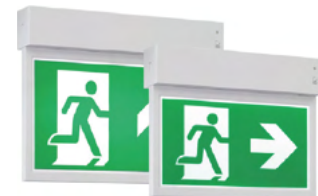
MXL/ESA10/LFP (large) MXL/ESA08/LFP/ (small)