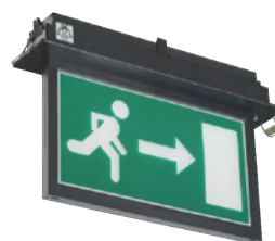
MXL/ESA10/D2/LFP/BLK (using black recessing accessory)