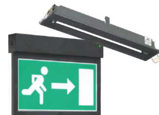
MXL/ESA10/D2/LFP/BLK (with black recessing bracket)