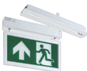
MXL/ESA11/LFP (using white recessing accessory)

These are ideal for applications requiring a more aesthetic installation.