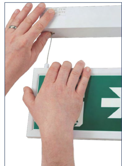
Simple height adjustment

NOTE: Self-Test is available for all versions but DALI-2 operation is only available for the larger sizes – ESA10 & ESA11.