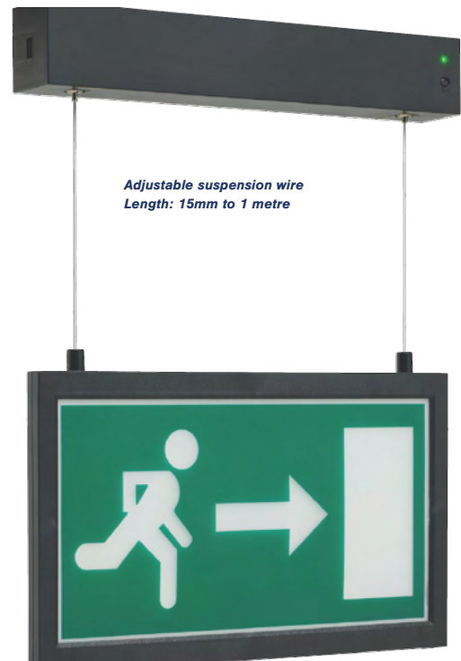
Adjustable suspension wire Length: 15mm to 1 metre

All of the MexLite range is available in white finish and the MexLite ESA10 and ESA11 and associated recess bracket are also available in black finish. The MexLITE ESA09 and ESA11 can have the legend panel suspended at different levels by just slipping the wires through the locking clutch bushes. The SELV supply to the LEDs is fed through the suspension wires.