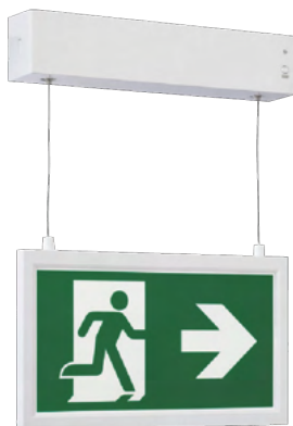
MXL/ESA09/LFP (small) MXL/ESA11/LFP (large)

The Wire Suspended versions utilise parallel suspension wires that allow the height of the legend to be easily set by the use of two locking clutch bush mechanisms.