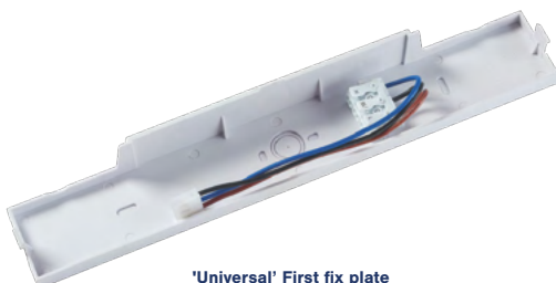
'Universal' First fix plate