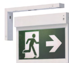
MXL/ESA10/LFP (using white side mounting accessory)