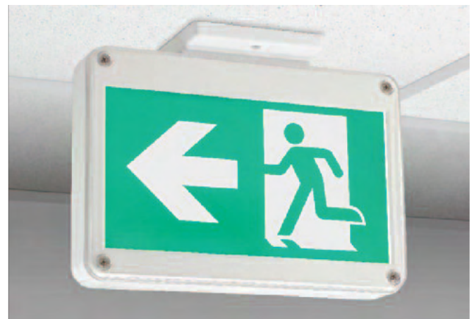
Every Manta sign is provided with a retro fittable second legend plate for ceiling or 'flagpost' wall mounted double sided installation.