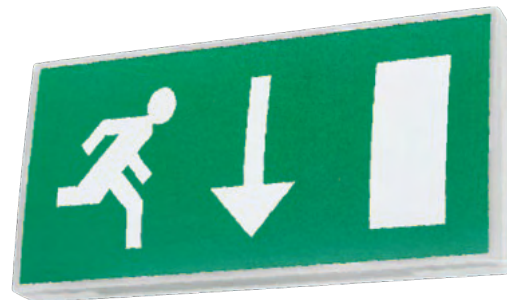
EC Signs Directive format