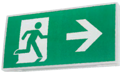
ISO sign format