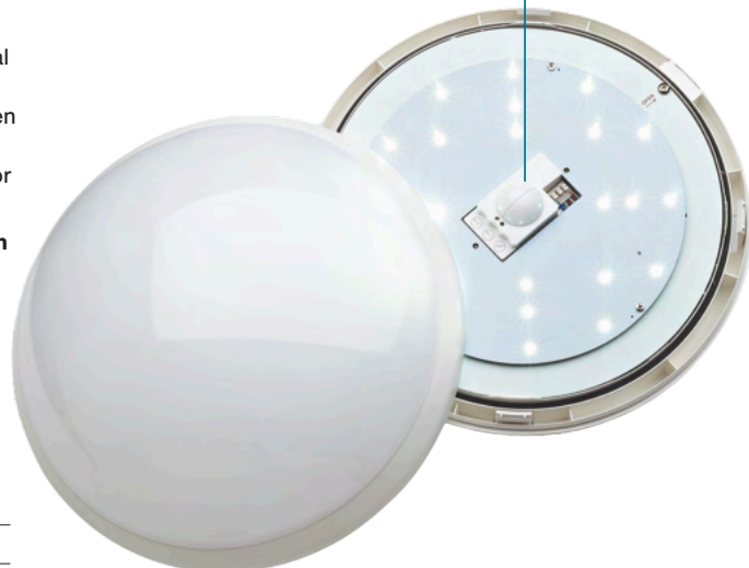
PS-RS02 Microwave Motion Detector (Optional)

Emergency Lighting Products Limited Parbrook House, Cillmans Industrial Estate, Natts Lane Billingshurst, West Sussex RH14 9EZ